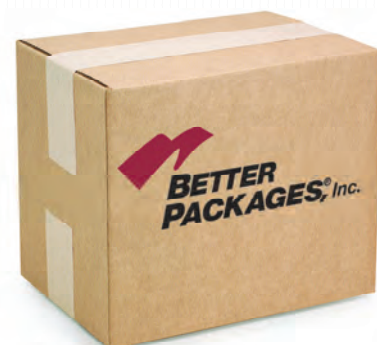
Carton sealed with Better Pack Tape and the BP 333 Plus