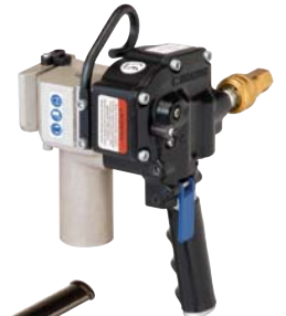
VTI-16 VTI-19 VTI-25