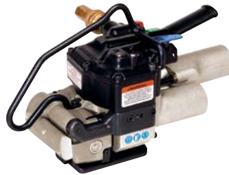
VT-16HD VT-19HD VT-25HD